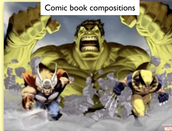
Comic book compositions